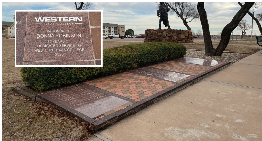
Above: The WTC Walk of Honor