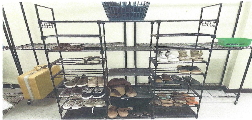
Two Shoe racks were purchased. $78.00

Pictured below is how the funds were spent.