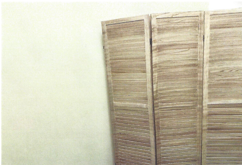
Room Divider. $173.00