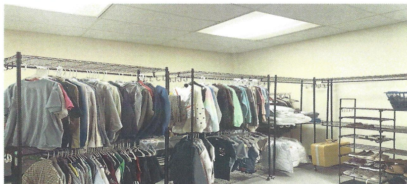
Five Rolling Clothes Racks, One hundred fifty hangers, and tabs. $732.00