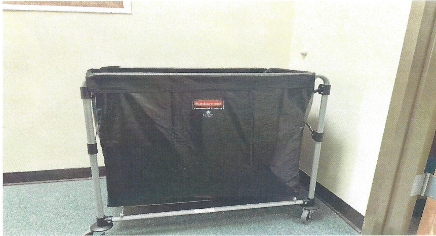
Rolling Donation Bin. $178.00