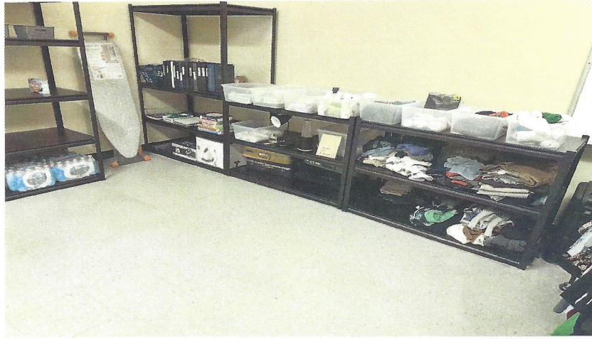
Plastic Bins for Toiletries, Socks, Hats, and Gloves. Ironing Board, Iron, and Steamer. $305.00